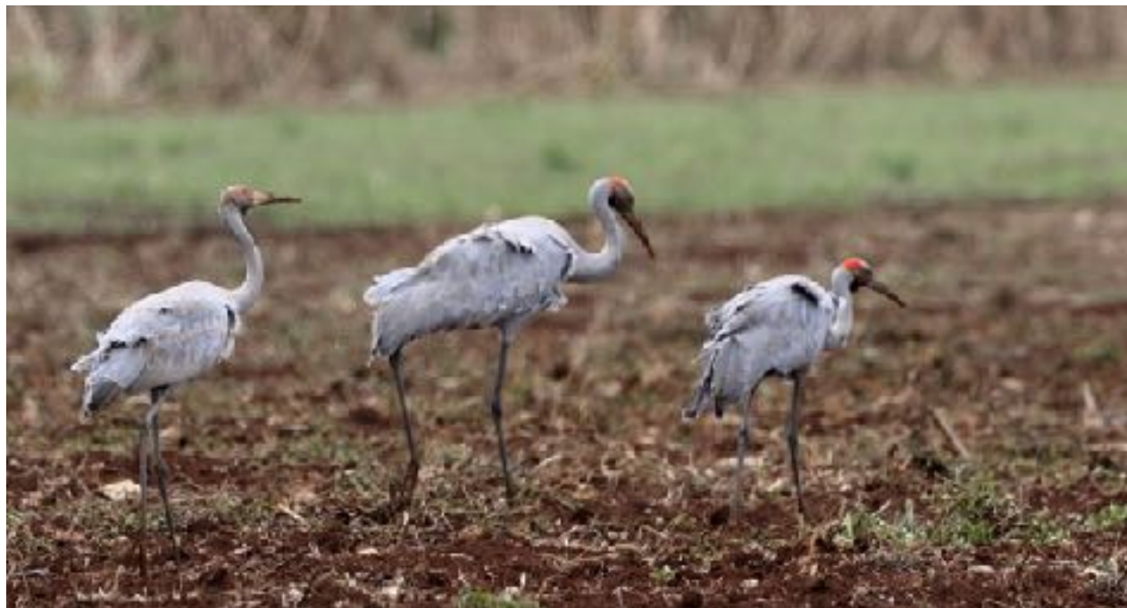
Figure 1: Brolgas in a paddock.