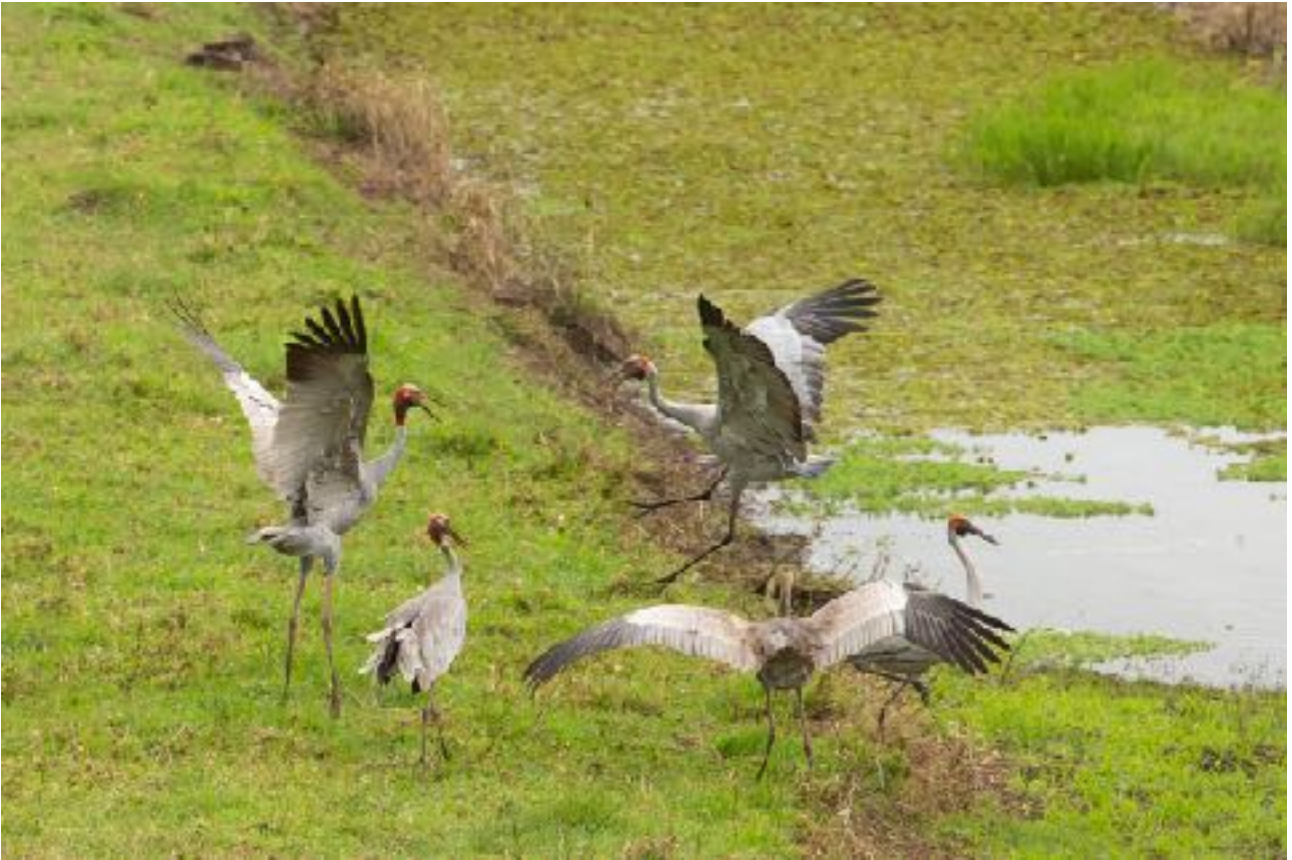
Interspecies dispute at Willets.