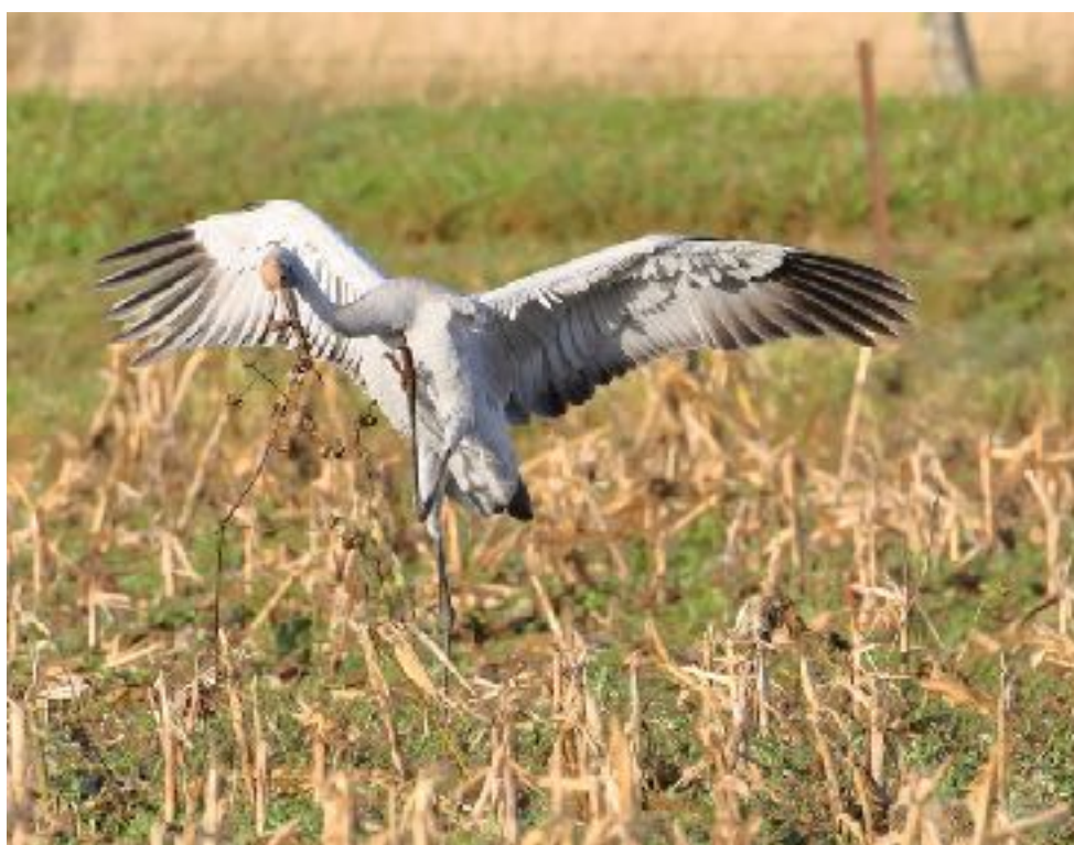
Juvenile Brolga.