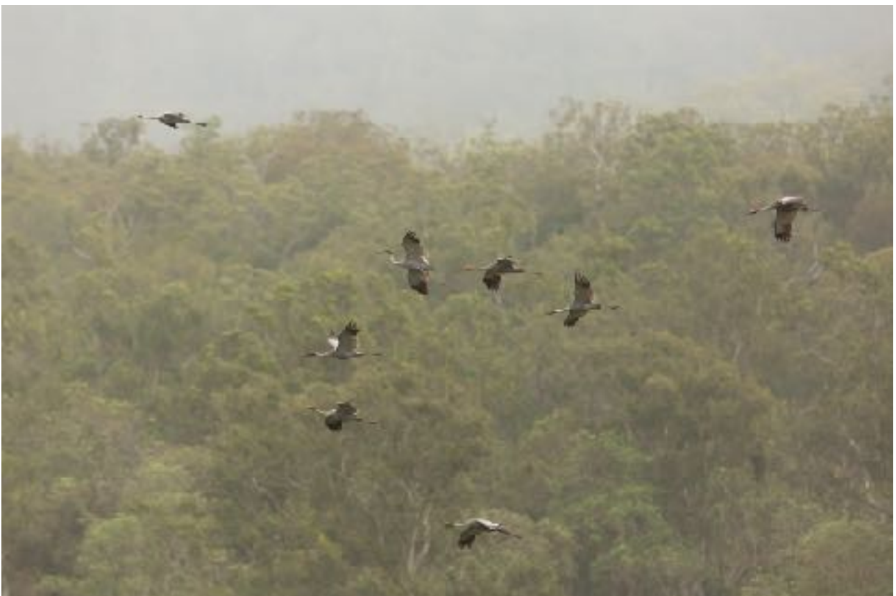
Mixed Group Flying in.