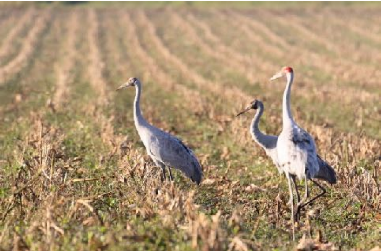
Brolgas in harvested maize paddock.