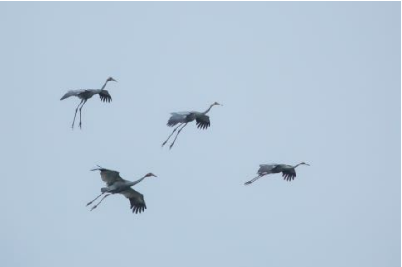
Sarus family flying in.